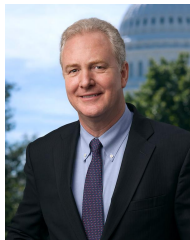
Chris Van Hollen, United States Senator from Maryland